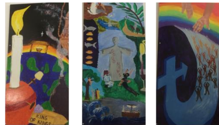
Incarnation Gospel Salvation